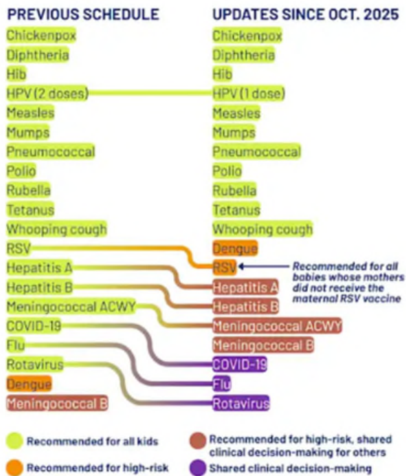
Yale SCHOOL OF PUBLIC HEALTH | January 7, 2026

Under these new guidelines, the number of vaccines routinely recommended for all children was reduced from 17 to 11. Vaccines for Hepatitis A, Hepatitis B, Dengue, RSV, and Meningococcal disease (ACWY and B) are now primarily recommended for high-risk individuals, while COVID-19, flu, and rotavirus vaccines are categorized under shared clinical decision-making.