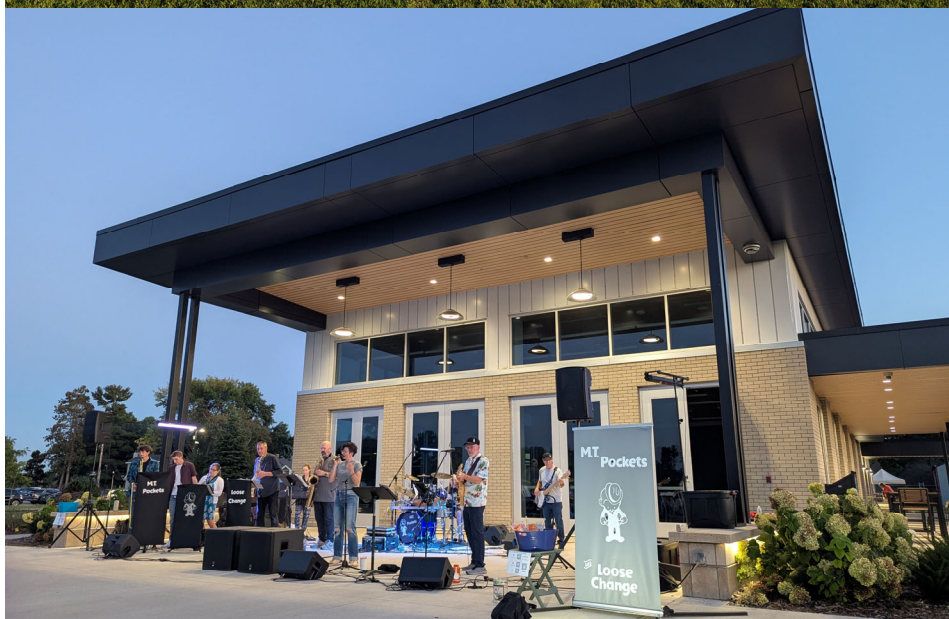
North Overhang of the Peder Pedersen Pavilion Sets the Stage