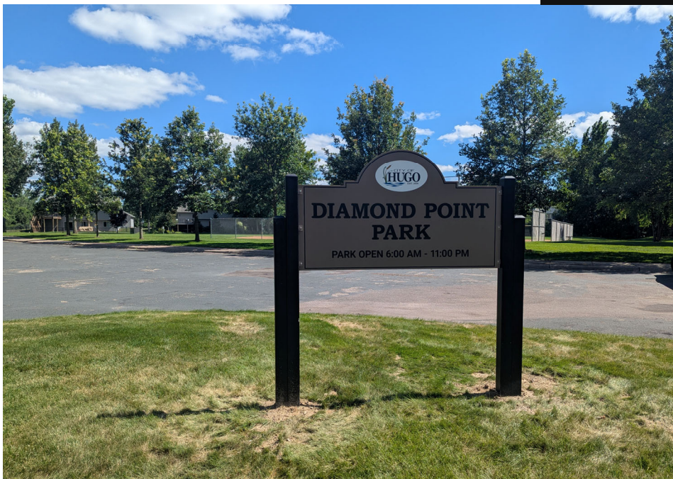
New Entrance Sign at Diamond Point Park