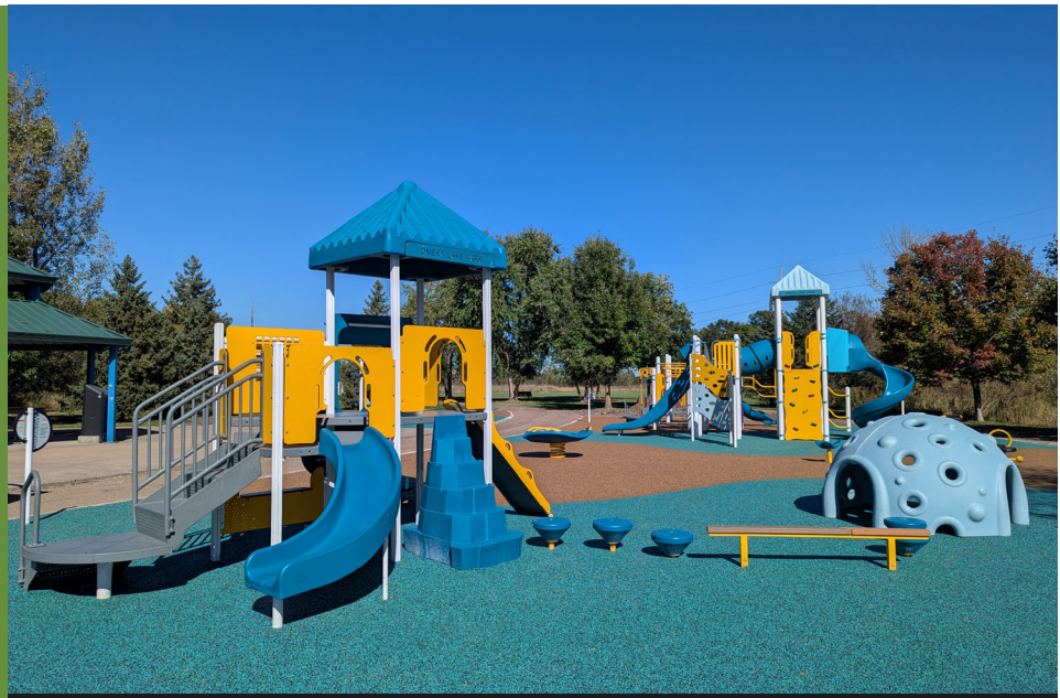
Bright Blues and Yellows of the New Playground at Oneka Lake Park

The City was notified in August that Washington County was awarded funding for construction of the remaining portion of the Hardwood Creek Regional trail. The City has plans to build trails on 130th and 140th Street and reconstruct the trail on Fenway Avenue. Staff continues to work with Washington County to move completion of the missing trail connections along.