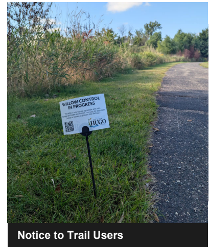
Notice to Trail Users

This memorial honors the service of military veterans, acknowledges their commitment to preserving our freedom, unites the community in a shared expression of gratitude, and advocates for the continued support and recognition of our veterans.