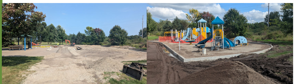
Construction Progress of Oneka Lake Park

Removals started in mid-August. The playground was installed in September. New drain tile was installed and the entry trail was graded to reduce the slope by Public Works. The asphalt looped trail was replaced in November. Staff cleaned up the site and hydroseeded following the trail pavement. Concrete work and shelter painting will be completed in spring 2026.