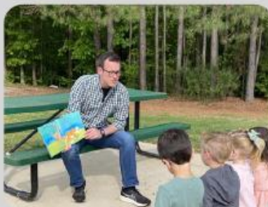
Last March: $4,286