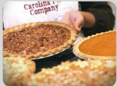
Last March: 133