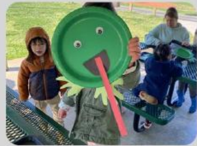
Last March: 285