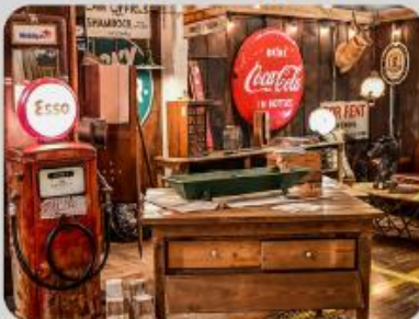
Last March: 17