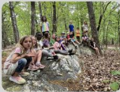
Last March: 20