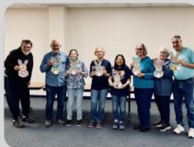
Last March: $1,529