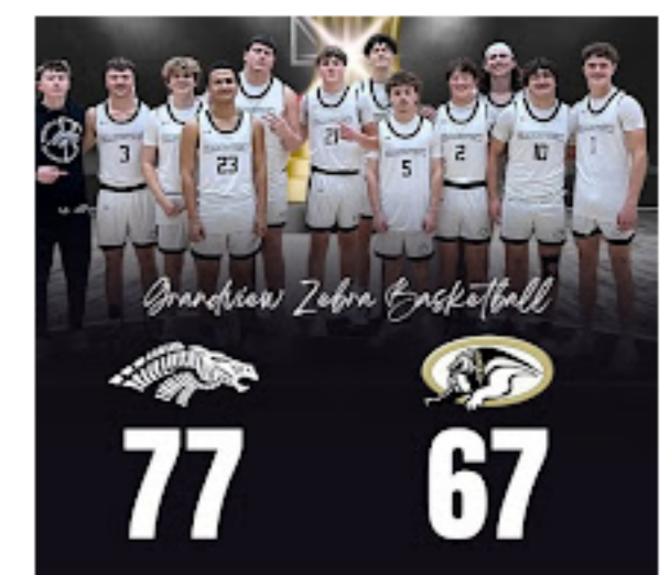
BIDISTRICT CHAMPS! Grandview Zebras took care of business and now heading to the Area Round!